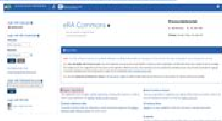
Figure 1 eRA Commons Homepage Registration Link

https://commons.era.nih.gov/commons/ol/ol/register-ol/register-ol-link