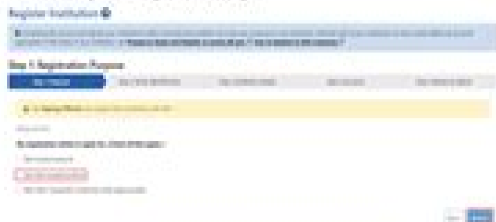
Figure 2 Register Institution from Step 1: Registration Purpose

DOC grant applicants should choose the "Non-FBI Grants/Contracts" option before clicking the "Next" button in the lower right of the registration webpage.