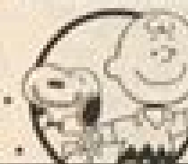
NEW! THE CHARLIE BROWN AND SNOOPY SHOW