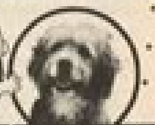
NEW! BENJI, ZAX & THE ALLEN PRINCE