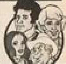
THE DUKES STARVING BO AND LUKE