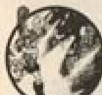
NEW! DUNGEONS AND DRAGONS*