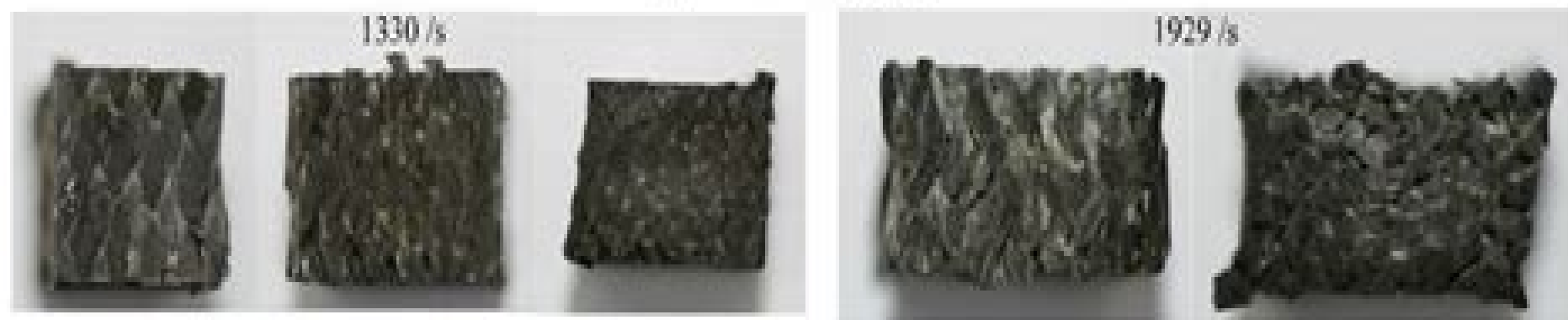
(b) 30° braiding angle