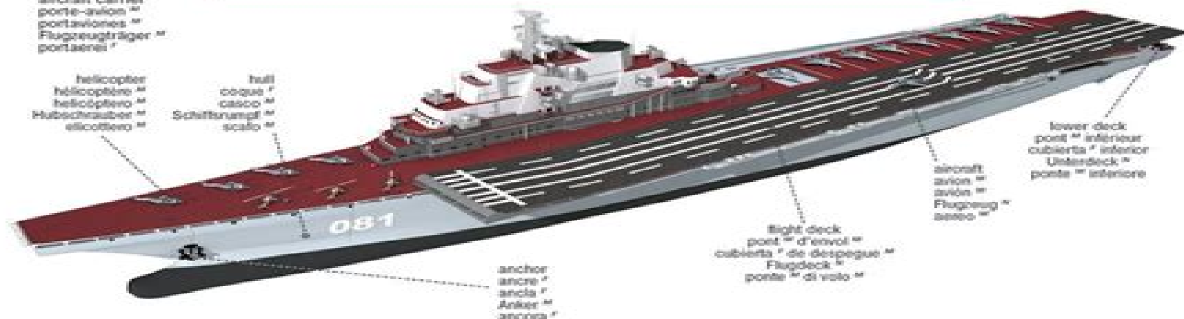
lower deck pont " inférieur cubierta " inferior Unterdeck " " ponte " inferiore " "