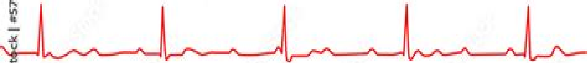
Third Degree Atrioventricular Block