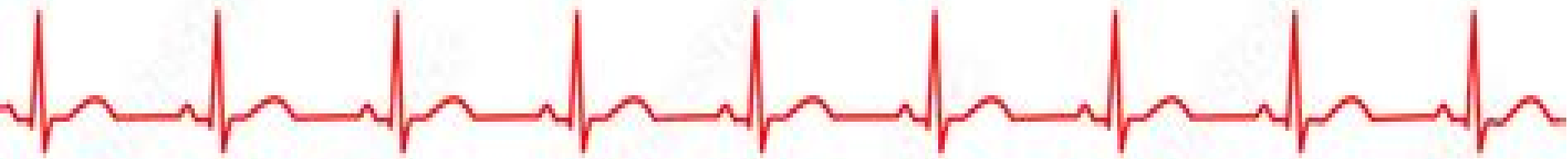
Normal Sinus Rhythm