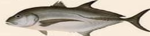
Great Thresher ( Centrolophus niger )