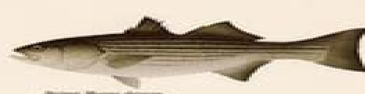
Striped Bass ( Morone saxatilis )