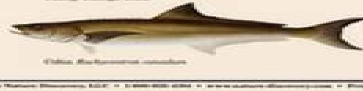
Cobia ( Rachycentron canadense )