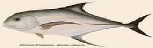
Silver Pompano ( Trachinotus argenteus )