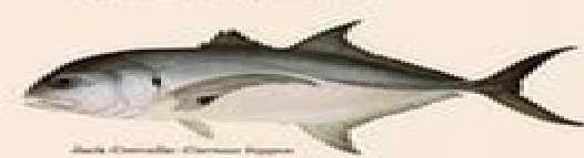
Jack Crevalle ( Micropogonias undulatus )