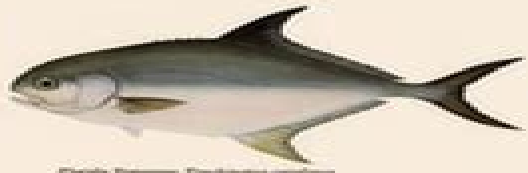
Florida Pompano ( Pseudosciaenops volitans )