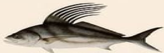
Bonefish ( Albula vulpes )