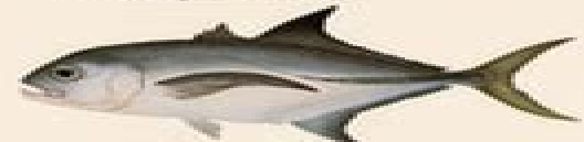
Horse Eye Jack ( Centropristis striata )