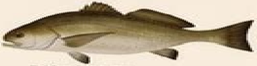
Black Drum ( Sciaenops ocellatus )