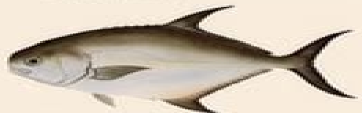
Permit ( Pseudosciaenops delaisi )