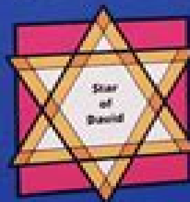
Star of David